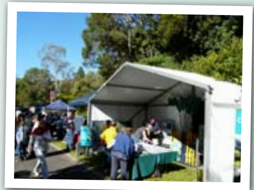
A sun shiny day at the Habitat Protection Stall at Indigi Day Out