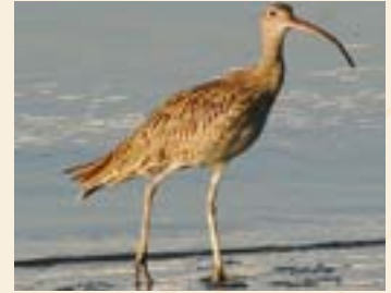
Eastern Curlew Numenius madagascariensis