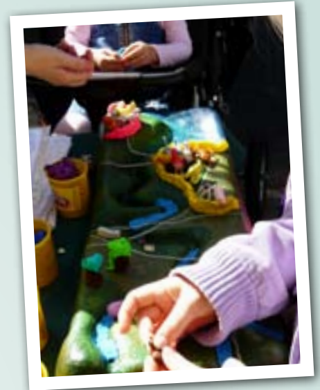
Children learning how to create a better future for the Redlands

Indigi Day Out 2010 was great! Danielle had a catchment model and invited the kids to use play-doh and toy farm animals to make a healthy catchment. They made fences for the farm animals to prevent sediment and nutrients entering the waterway, and put lots of trees and shrubs on the creek banks (or 'riparian areas'). The children took away some basic catchment management principles whilst the parents also learnt about some changes they can make at home to help improve Redlands' creeks. The kids really enjoyed the activity and some parents even got into it too!