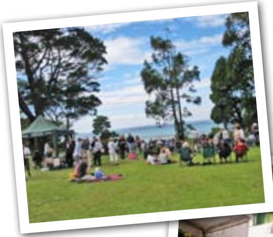
Bringing the Bushcarers together at this year's Annual Social Day on 31 July