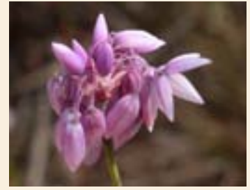
Vanilla Lily Sowerbaea juncea

It's not just plants to keep an eye out for, our cuckoos are making lots of noise and spring migrants such as bee-eaters, drongos and orioles are all around. If you head down to the foreshore our international visitors, the migratory waders, can be found – Point Halloran is a great spot! If you're looking for something specific, plant or animal, give us a call at IndigiScapes and hopefully we can help.