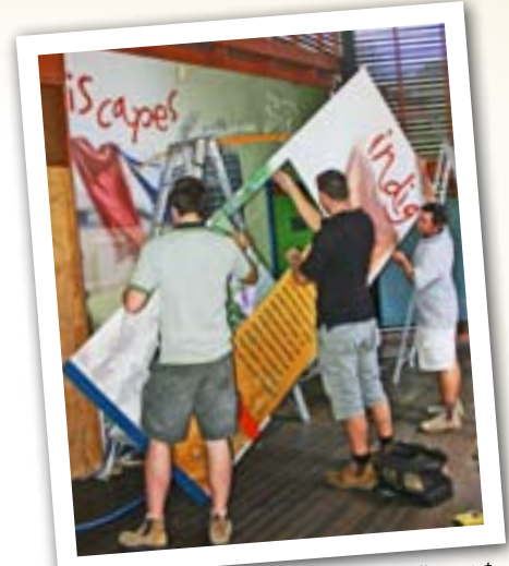
Installation of the native plant display wall as part of the 'Your Backyard Garden Program'

We are starting to see some changes to the gardens of IndigiScapes that will offer different experiences for those that have been coming here for a long time. The IndigiScapes 'niche' of local native plants is a terrific one, and I honestly believe we have the potential to be one of the best small botanic gardens in the country. Delivering on that potential is my biggest challenge.