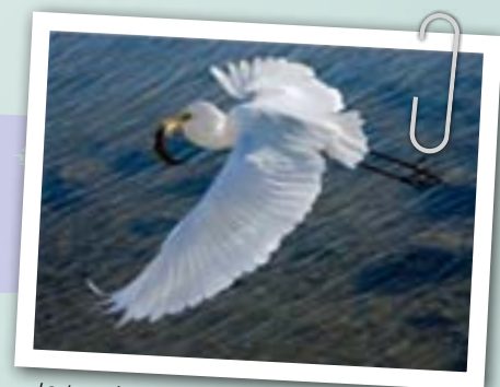
Last year's winning shot: can you top this?