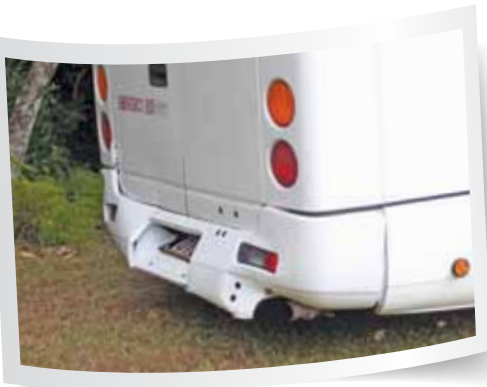
Habitat Protection will stop at nothing for our volunteers. Unfortunately a bit of damage was done to the rear of our bus climbing the steep driveway during a Land for Wildlife visit in the Gold Coast Hinterland in 2008.