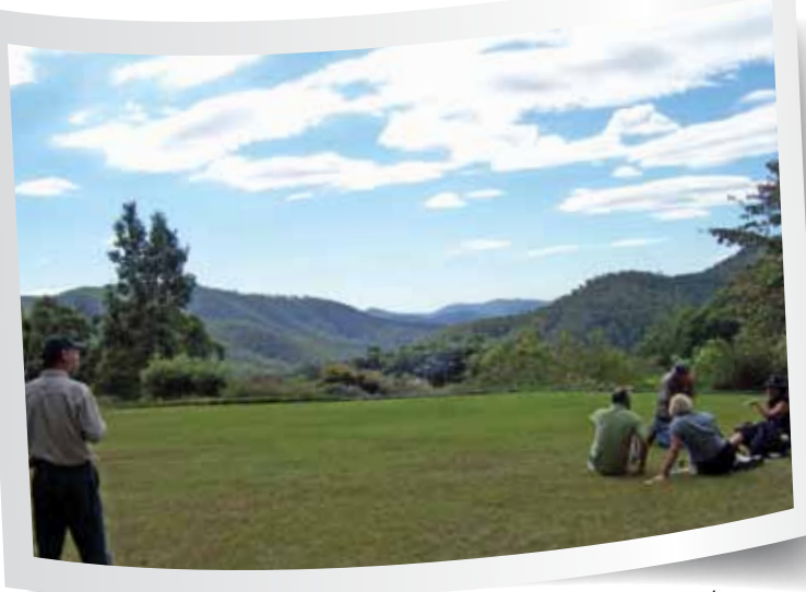
The view was definitely worth it once we arrived at the top!

6,619 Sandwiches have been consumed over the years. The most popular is turkey, camembert, cranberry and mesculin.